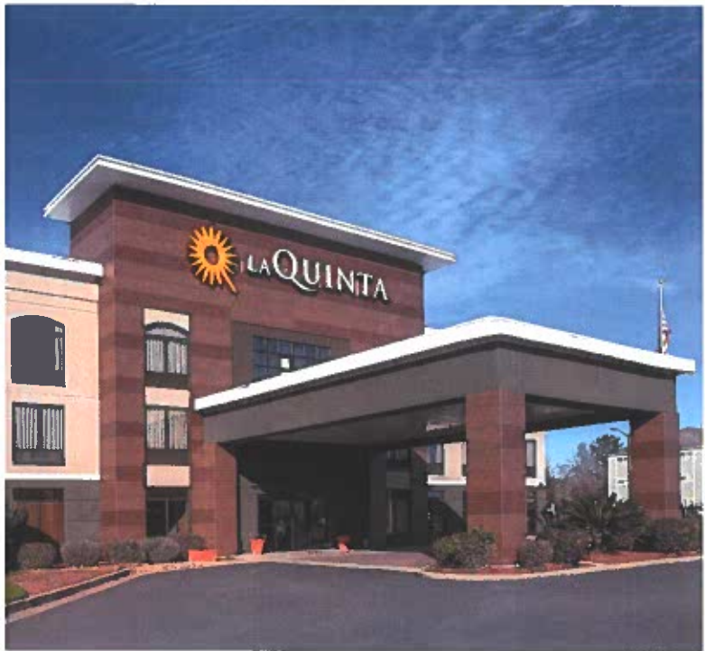
La Quinta Inn & Suites by Wyndham-Albany GA 2735 Dawson Rd, Albany, GA 31707 Phone: (229) 883-9800