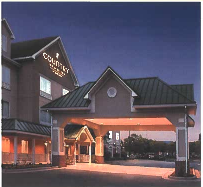
Country Inn & Suites by Radisson, Albany, GA 2809 Nottingham Way, Albany, GA 31707 Phone (229) 317-7100